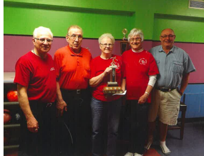
"A" Side Winners