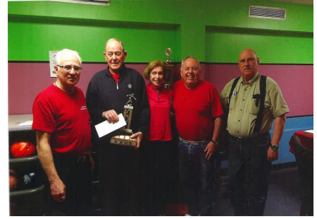
"B" Side Winners