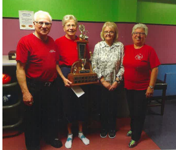
Grand Aggregate Winners