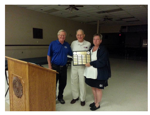
We receive the Trophy